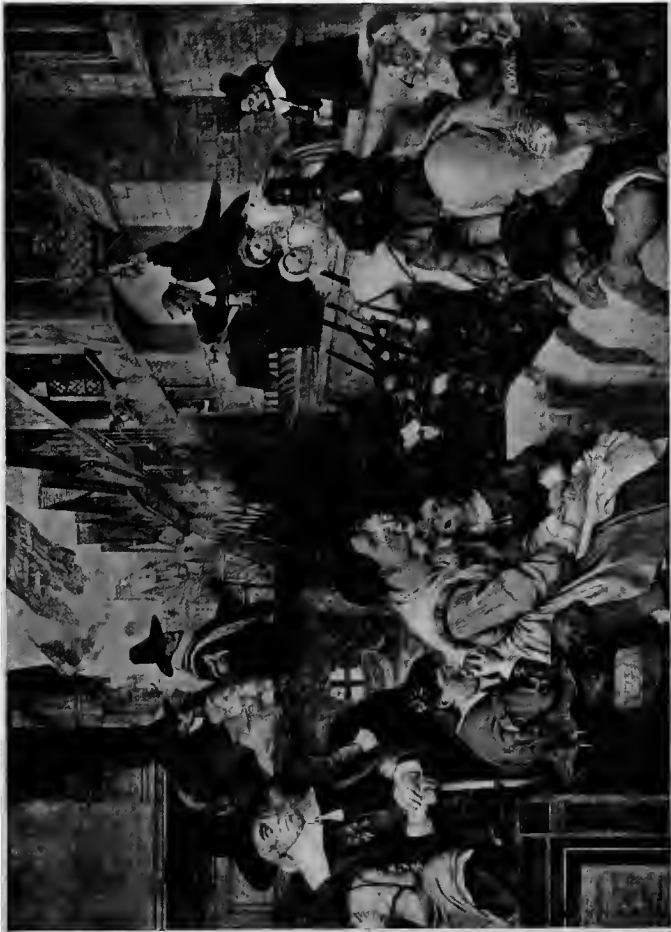
The Setting out of the Train-bands from London to raise the Siege of Gloucester